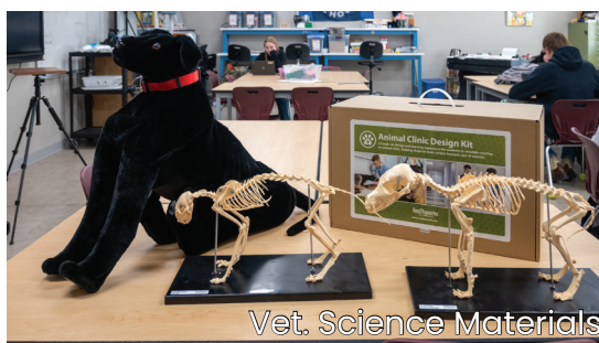
Vet. Science Materials