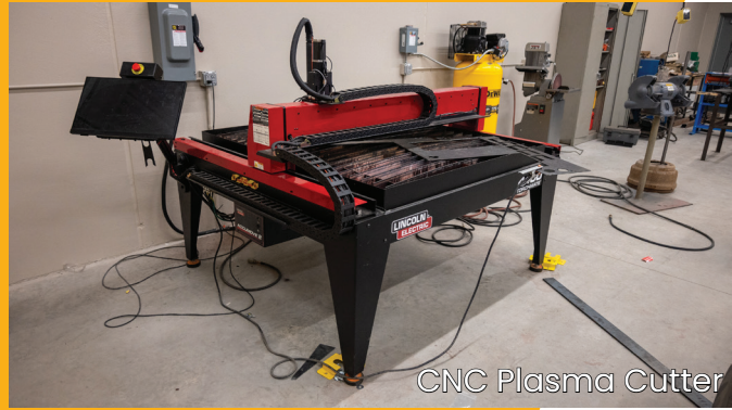
CNC Plasma Cutter